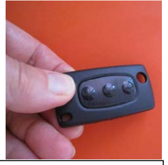
Next press fit your new key pad in the top cover. No gluing is required. Once key pad is in, put your remote together in reverse order and close it.