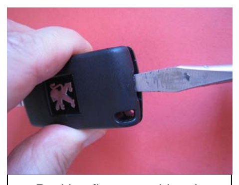
Position flat screwdriver in a small slot located at the bottom Of remote and twist it. Remote will split open.