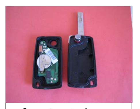
Separate parts of your remote. One part consists of key blade and top part with key buttons and electronic board.