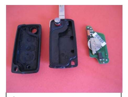
Separate electronic board from top part of your remote in preparation for removing an existing plastic key pad.