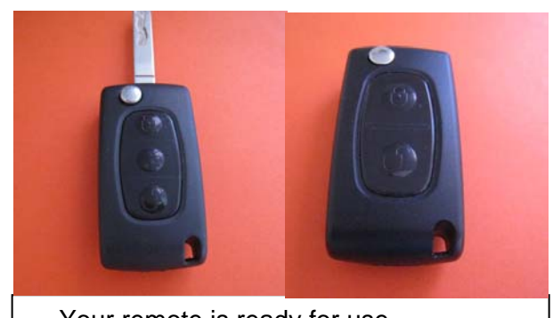
Your remote is ready for use. No re-programming is need it as remote will work straight away.